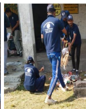
Observation of Swachata Pakwada