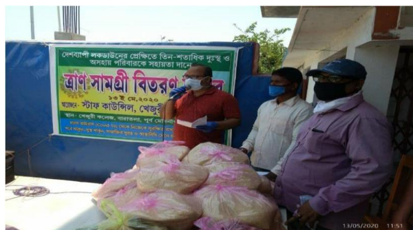
Relief works During COVID-19 lockdown