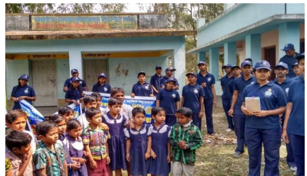
Awareness on 'Importance of Health and Hygiene on Public Health'