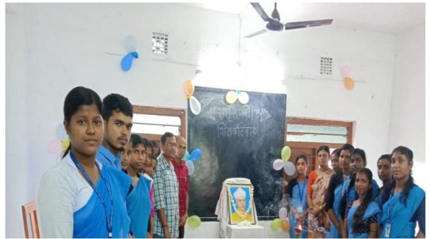
Celebration of Teachers' Day