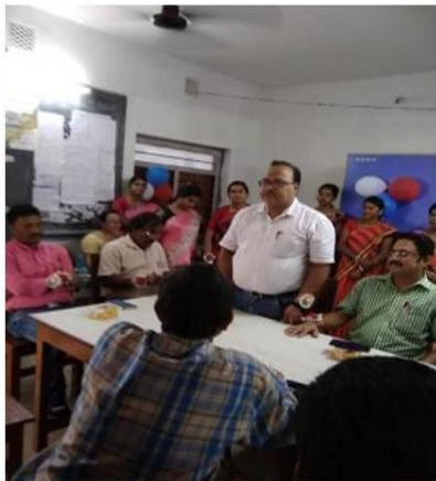
Raksha Bandhan Utsav