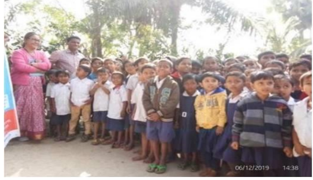
Awareness Campaign on Vector Born Disease and Health Hygiene