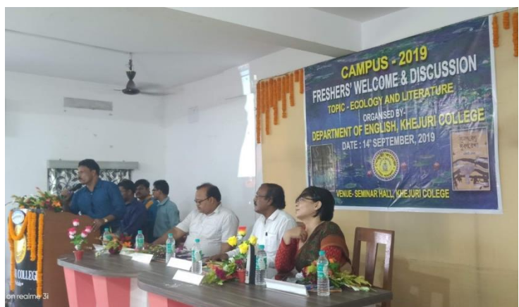
Fresher's Welcome and Discussion