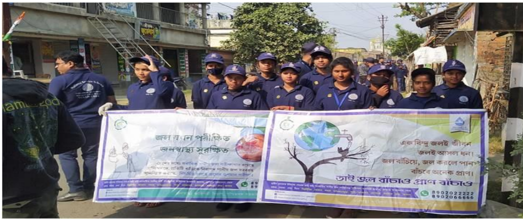
Awareness on Water conservation – 'Save Water Save Life'