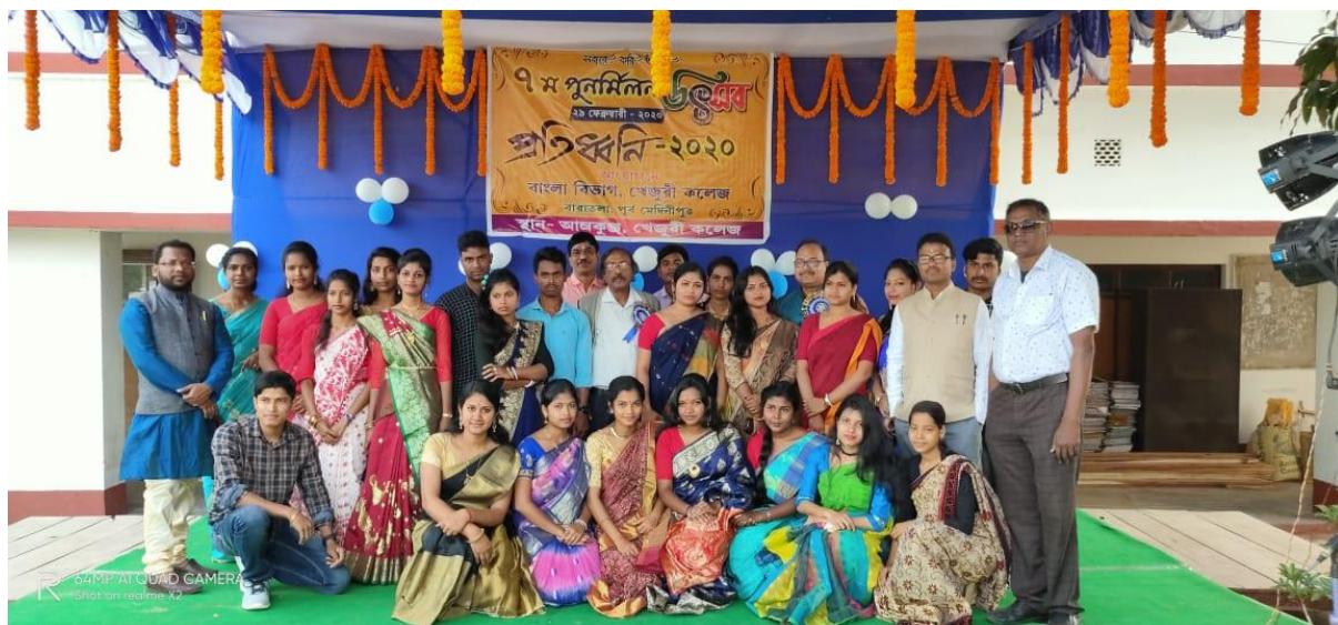
Alumni Meet of the Department of Bengali