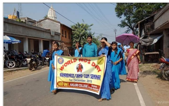
Awareness on World AIDS Day Celebration